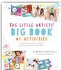
The Little Artists' Big Book of Activities by Shannon Wong-Nizic