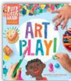
Busy Little Hands: Art Play! by Meredith Magee Donnelly