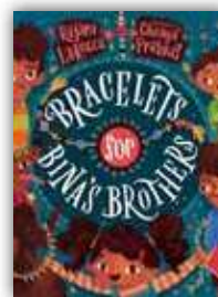
Bracelets for Bina's Brothers by Rajani LaRocca

Scan this code to open a guide you can print and use for drawing new patterns!