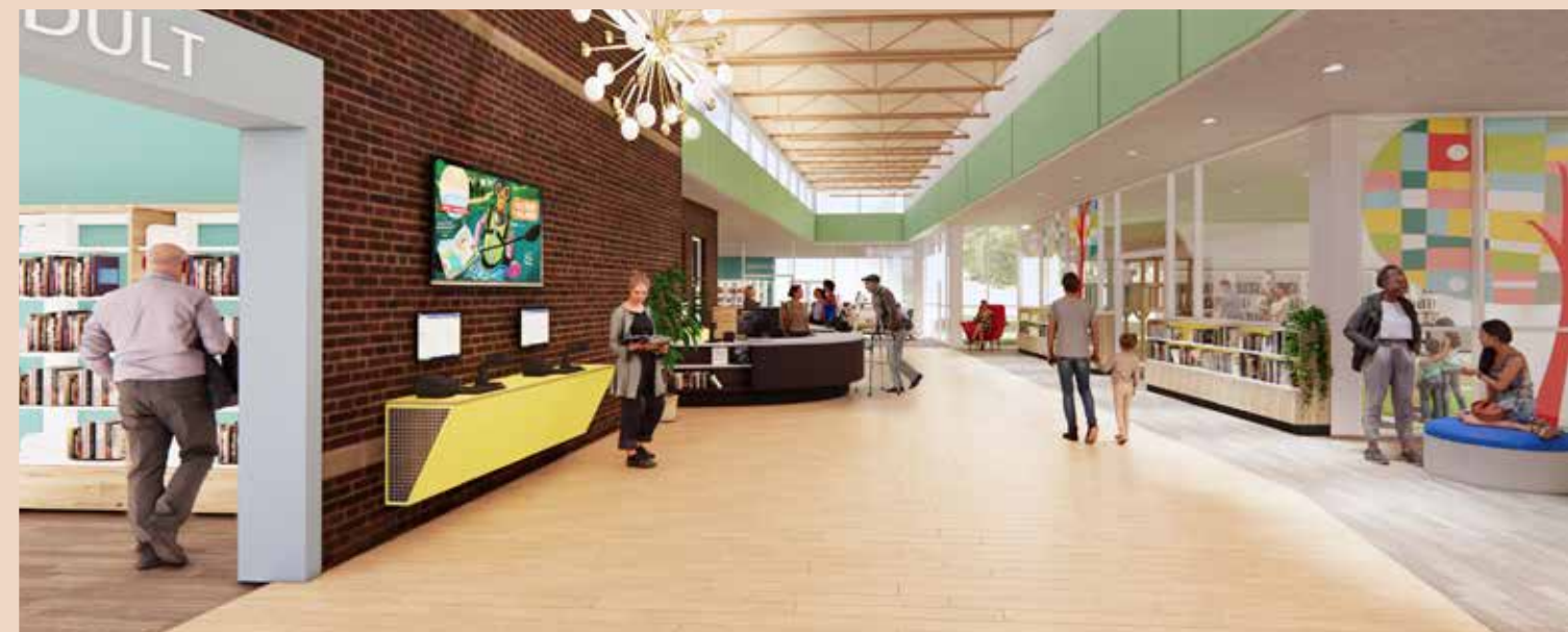
Preliminary concepts, subject to change.

With the additional space, we can enhance our collaboration with all area schools to further the education of our young people. We can meet the needs of more community groups seeking places to gather. We can even more profoundly impact businesses and restaurants in downtown Rockford by driving additional foot traffic to the area.