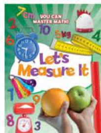
Let's Measure It by Mike Askew