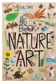
The Big Book of Nature Art by Yuval Zommer