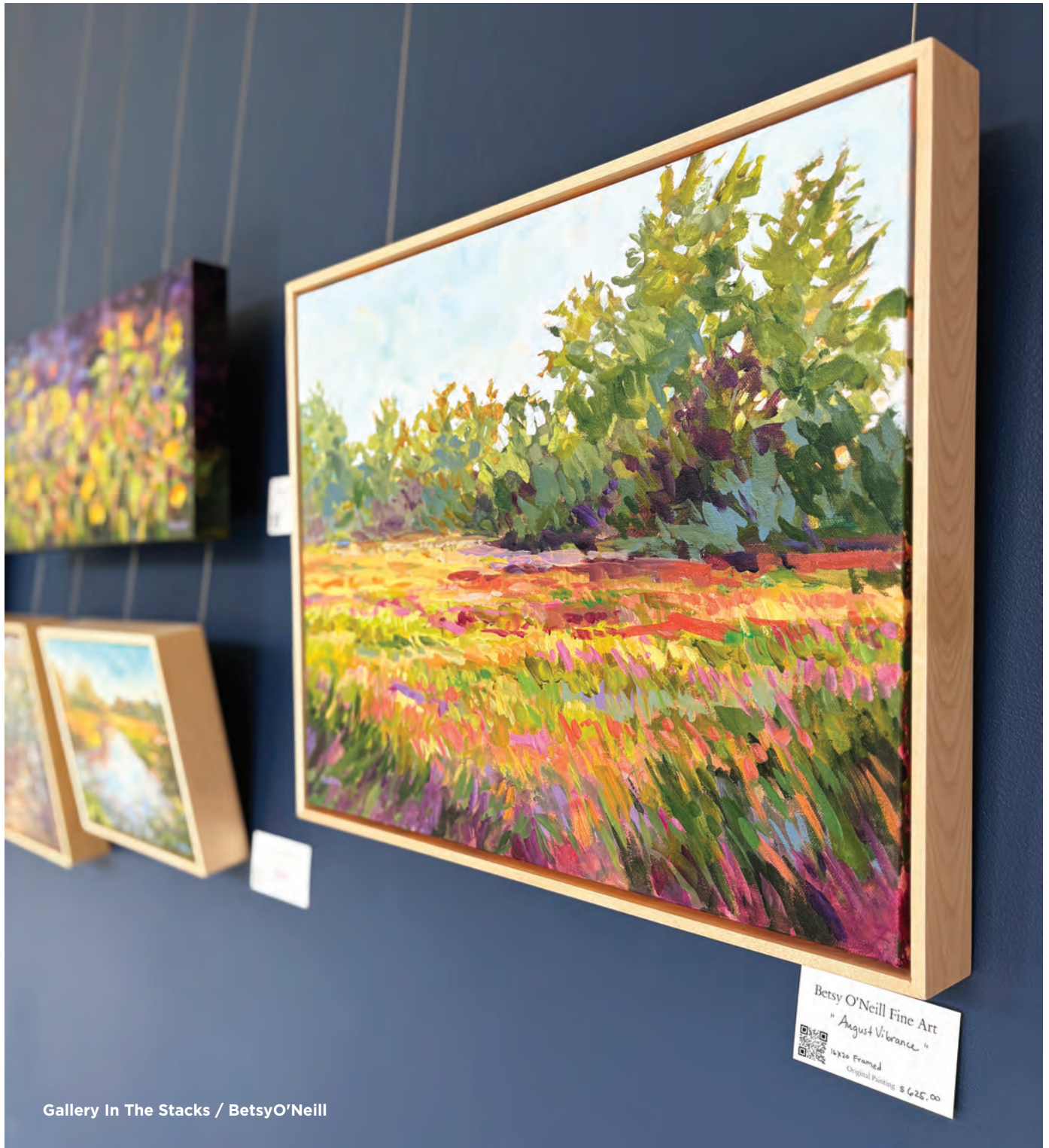
Gallery In The Stacks