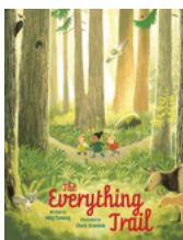
The Everything Trail by Meg Fleming