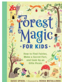
Forest Magic for Kids by Susie Spikel