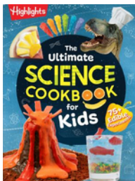
The Ultimate Science Cookbook for Kids by Highlights