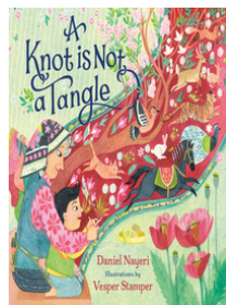
A Knot is Not a Tangle by Daniel Nayeri