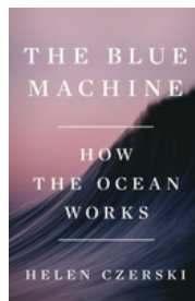
The Blue Machine: How the Ocean Works by Helen Czerski